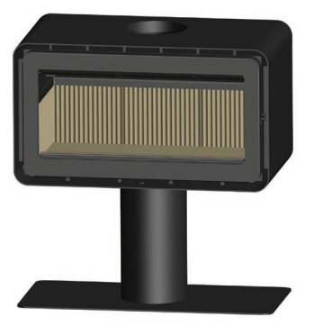
Hayra 85P Freestanding Pedestal